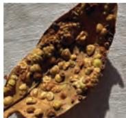
Spangle Oak Gall Wasp larvae