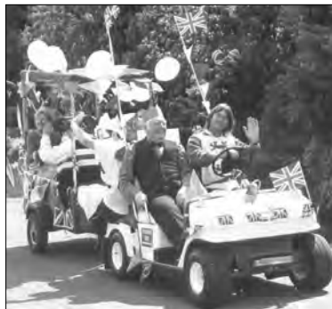
Procession passing down Bridge Street June 3rd 2002