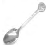
Spoon presented to children in 2002