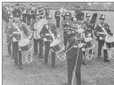
Band of the Queen's Division playing for Jubilee 1977