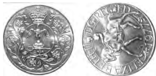
Jubilee Crowns presented 1977

October 1 st Musical Evening Whaddon Church