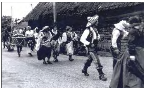
Procession passing Town Farm