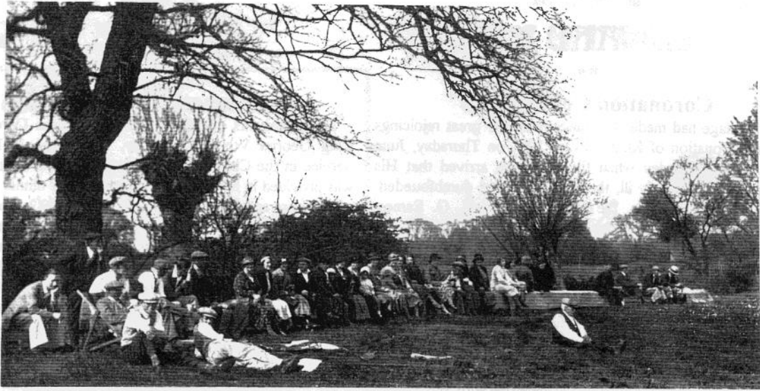
Watching the Cricket Match