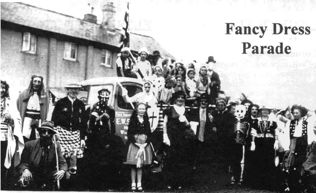
Outside Home Cottages