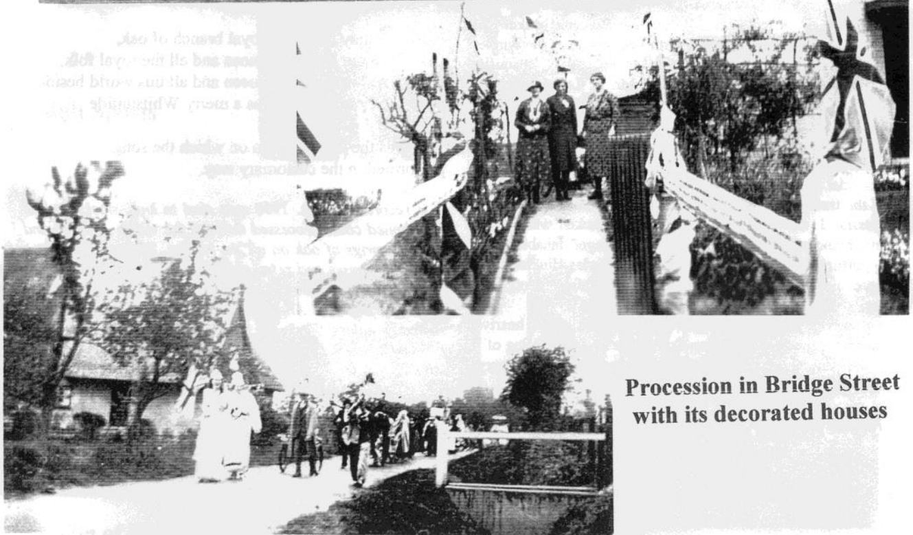
Procession in Bridge Street with its decorated houses