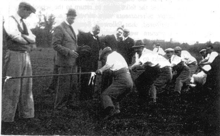
Tug of War Married v. Singles (Singles won)