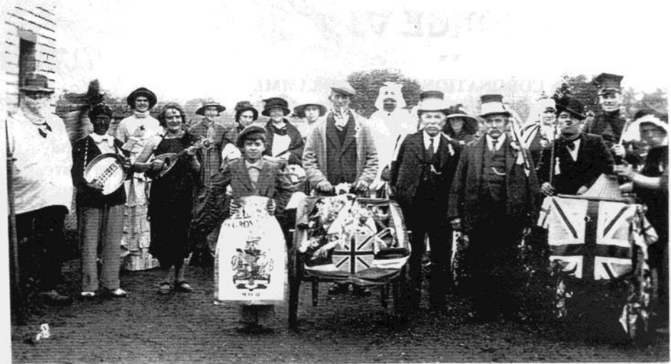
Fancy Dress Procession