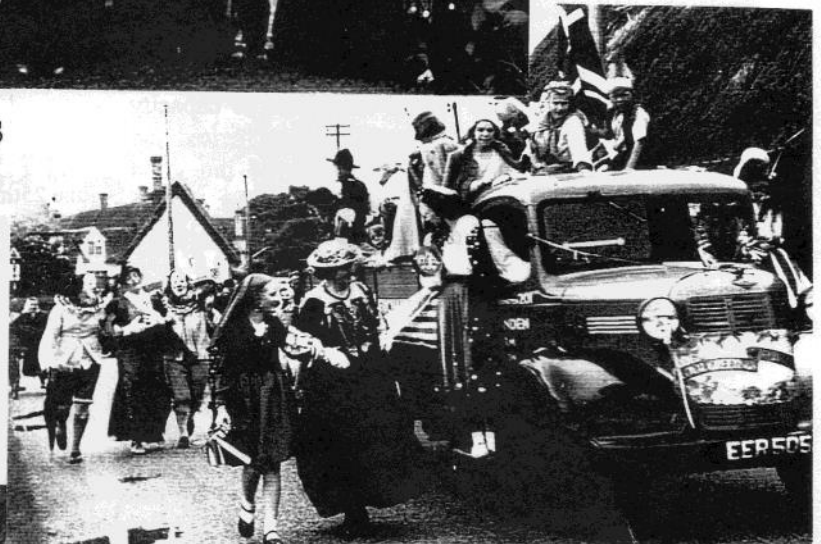
Passing Town Farm